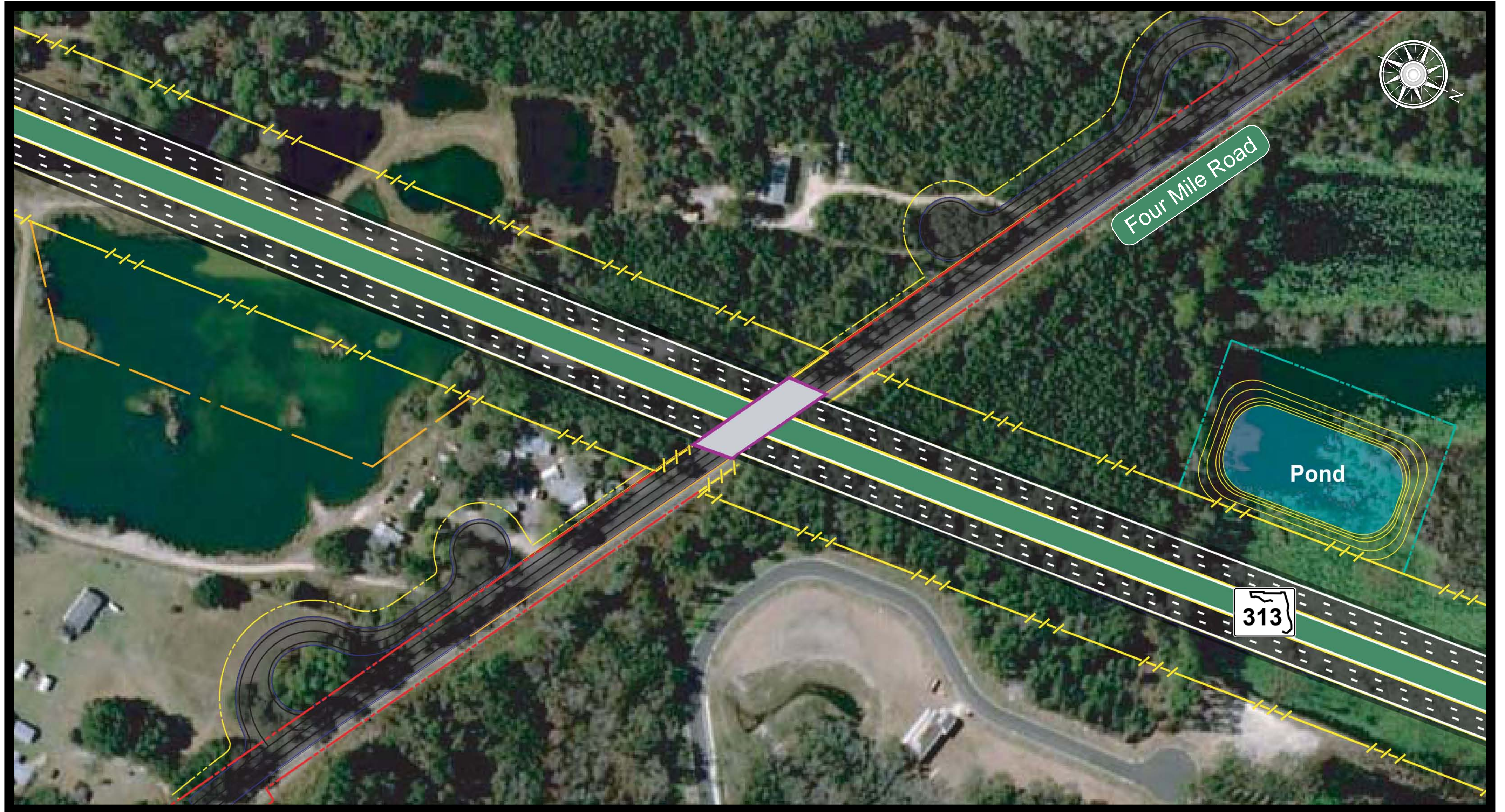
Alternative Two - Four Mile Road Over SR 313