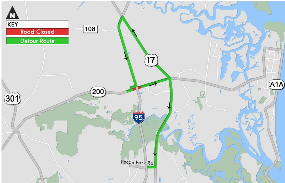
Westbound SR 200 Detour Route