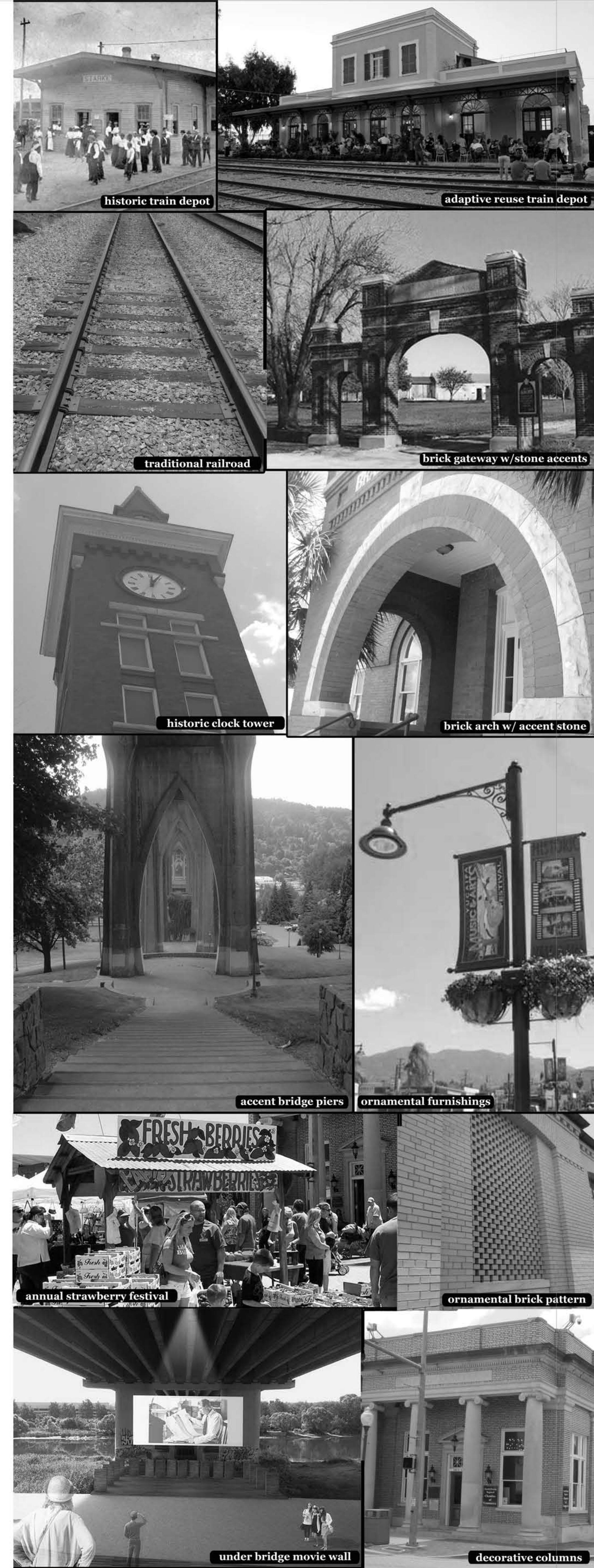
Design Inspiration Images