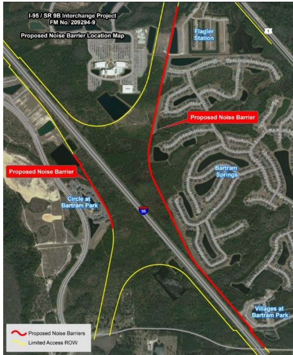
Image at the left shows the proposed location of noise barrier walls.